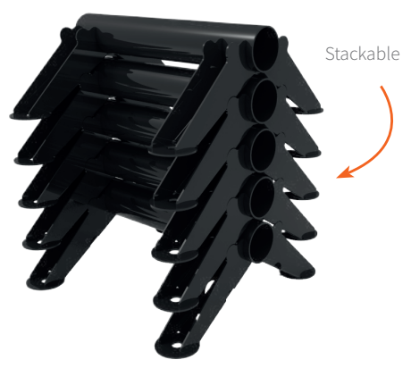
Design registered in the EU and UK