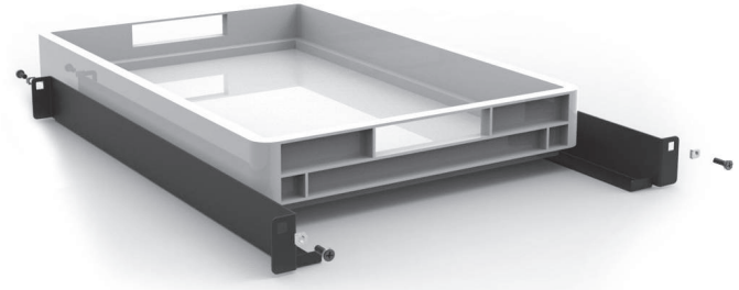
Drawer profile included with plastic crate set